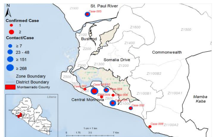
Figure 1: Geographical Distribution of Confirmed Cases by Health Districts, Montserrado County, 5 April 2020