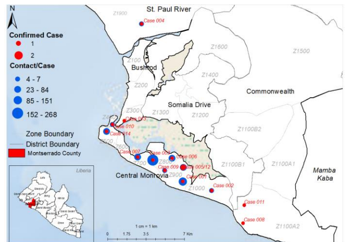
Figure 1: Geographical Distribution of Confirmed Cases by Health Districts, Montserrado County, 6 April 2020