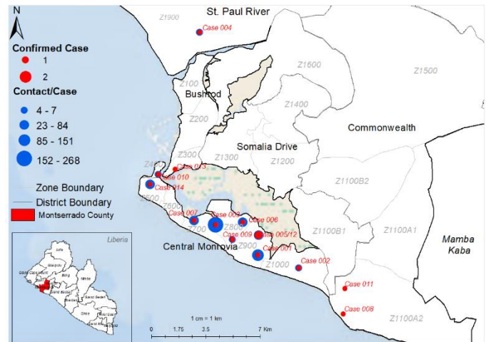
Figure 1: Geographical Distribution of Confirmed Cases by Health Districts, Montserrado County, 7 April 2020