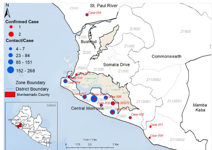
Figure 1: Geographical Distribution of Confirmed Cases by Health Districts, Montserrado County, 8 April 2020